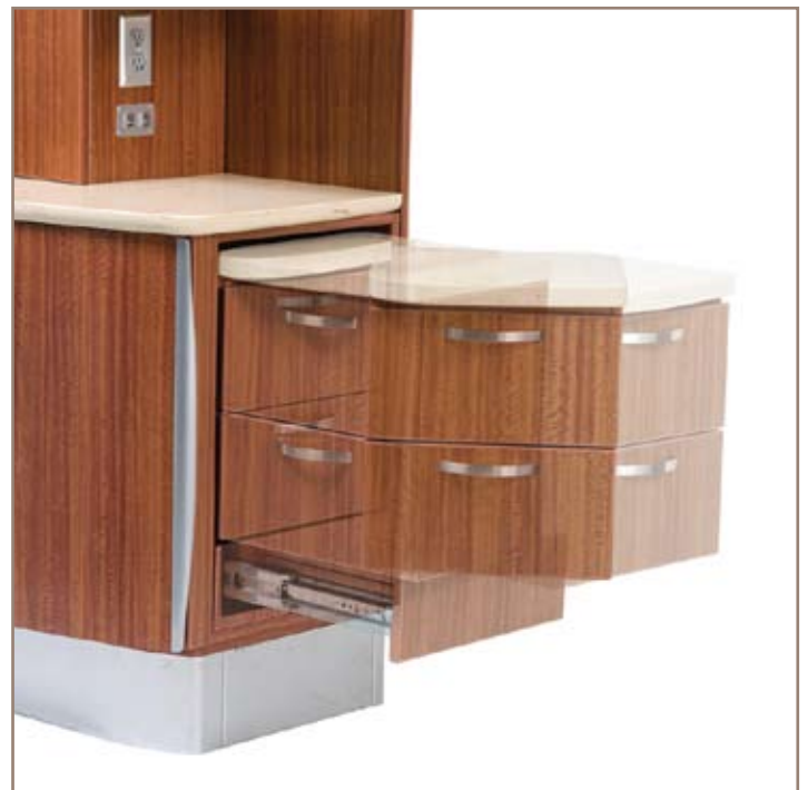
Cabinetette slide out system for Rear Cabinet