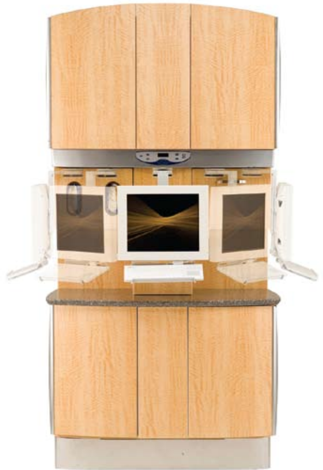
Sliding monitor/keyboard mount

Renaissance™ conforms to your movements and requirements