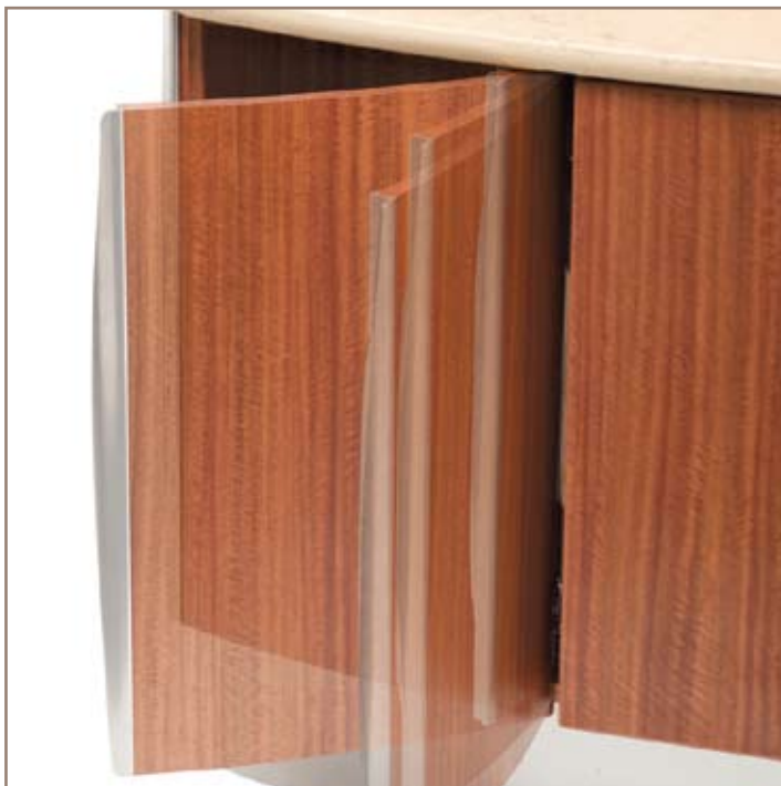
Pocket door system for Rear Cabinet